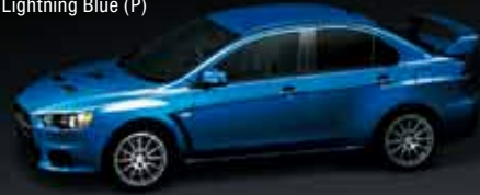
Lightning Blue (P)