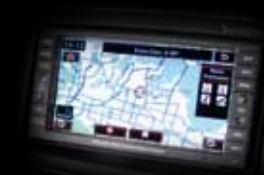
Mitsubishi Multi Communication System