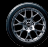
18" BBS forged aluminium wheels