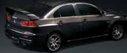
Phantom Black (M)